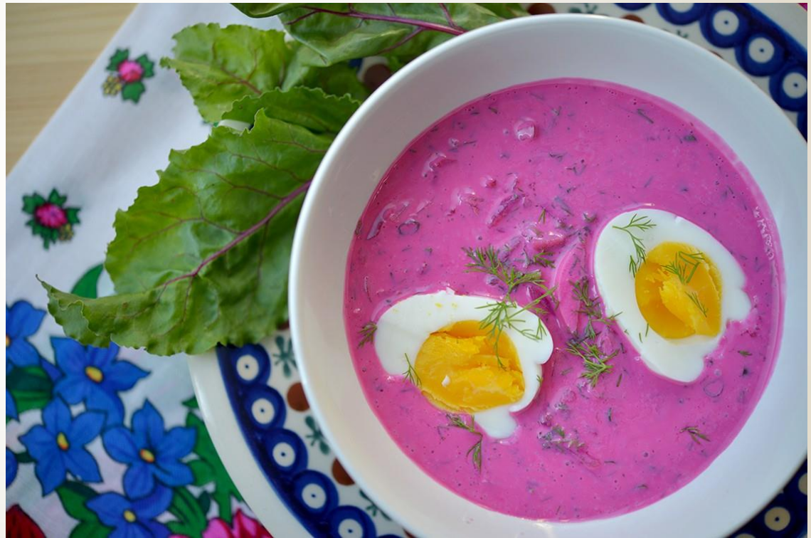
The Pink Soup