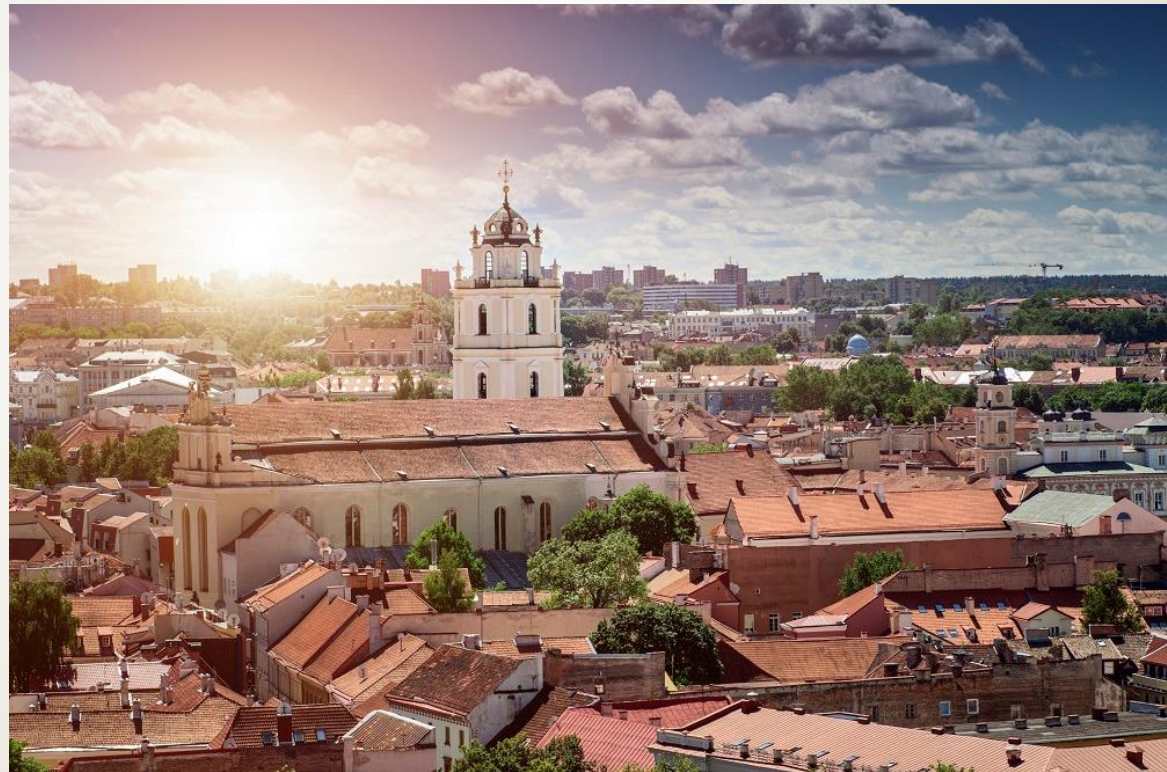
The Old Town of Vilnius